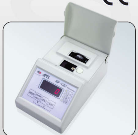
Cover prevents light penetration from outside.