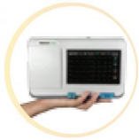
Less than 1 kg

A variety of fantastic features are embodied in an amazing small body, making it more than just a 3-Channel ECG.