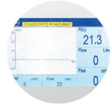
7" LCD screen