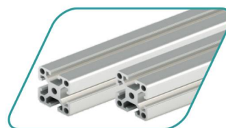
Aluminium alloy material