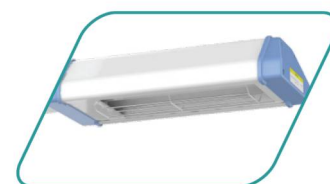
Heating head with metal grid

Main body (including the Radiant source, Control system, Infant bed, Bracket), I.V. pole, Skin temperature sensor, Tray, Mattress, Transparent protector, Castors, RS-232.