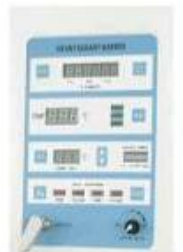
Air Temp count up/down timer