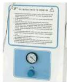
Built-in Low pressure Aspirator