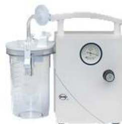
Low pressure Aspirator