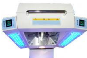
ESBL-60 phototherapy unit