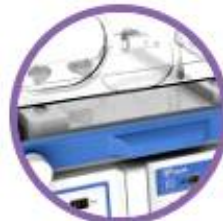
X ray cassette & Integrated scale