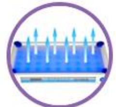
Downside LED phototherapy unit BL-100