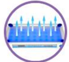
Downside LED phototherapy unit BL-100