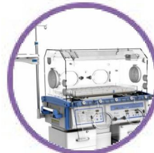
Double Wall Hood