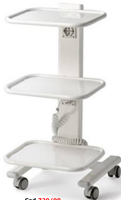
Cod. 720/00 Optional Trolley