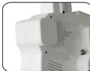
Built-it digital capture system