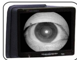
Optional 7" LCD screen to Improve the observation