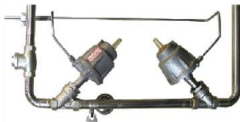
Pipeline system adopts stainless steel sanitary pipe and world brand pneumatic valve