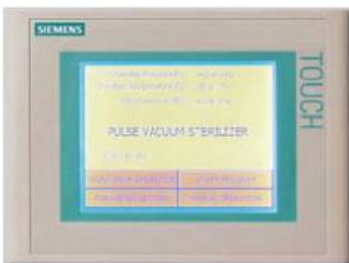
SIEMENS Touch Screen Display