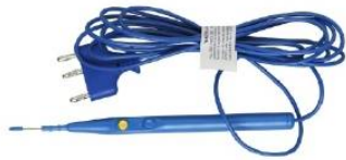
Disposable Hand Switch Pencil