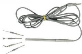
Chuck Handle with Electrodes Autoclavable