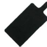
Silicon Patient Plate