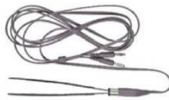
Bipolar Forcep Autoclavable