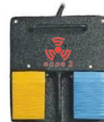
Monopolar Double Pedal Footswitch